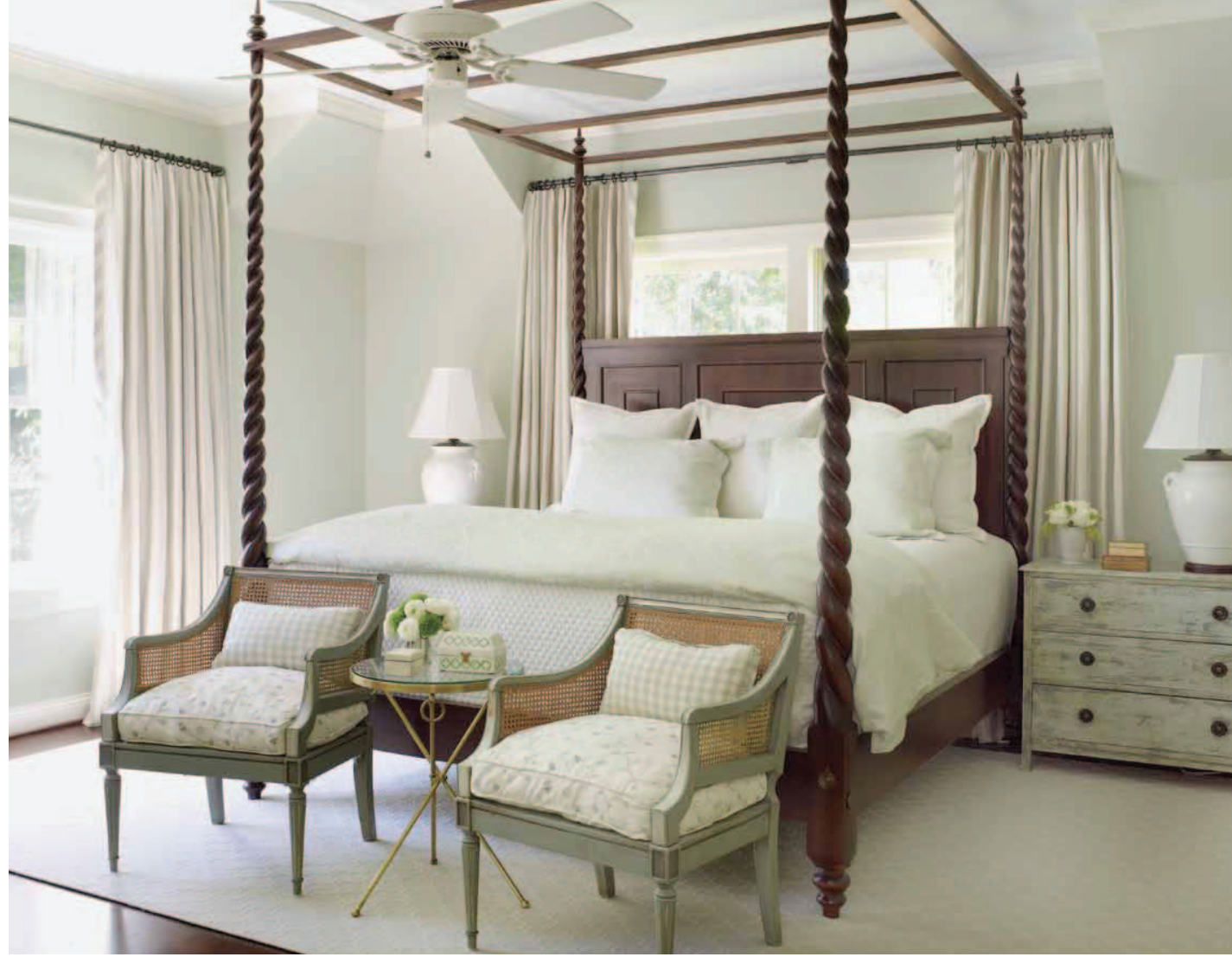
Above: A custom four-poster bed takes center stage in the airy master bedroom and is outfitted with linens from Longoria Collection. Chairs from Watkins Culver Antiques & Design are covered in fabric by Chelsea Editions. Right: The elegant master bathroom includes Carrara marble tile flooring from Materials Marketing and countertops from Walker Zanger.