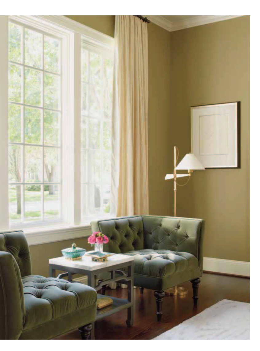
A cozy sitting area in the dining room includes Rogers & Goffigon velvet tufted chairs from Bungalow Classic that sandwich a vintage table lacquered with a custom stone top. Custom draperies made from a Nancy Corzine silk through Allan Knight Associates frame the view.